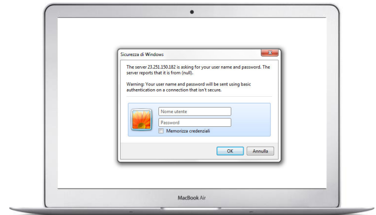
Cogito for Google Search Appliance